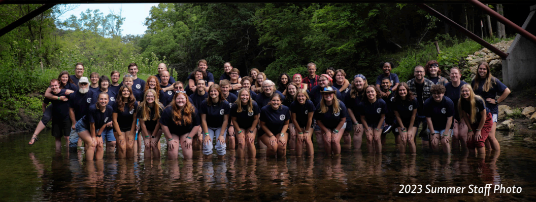
2023 Summer Staff Photo