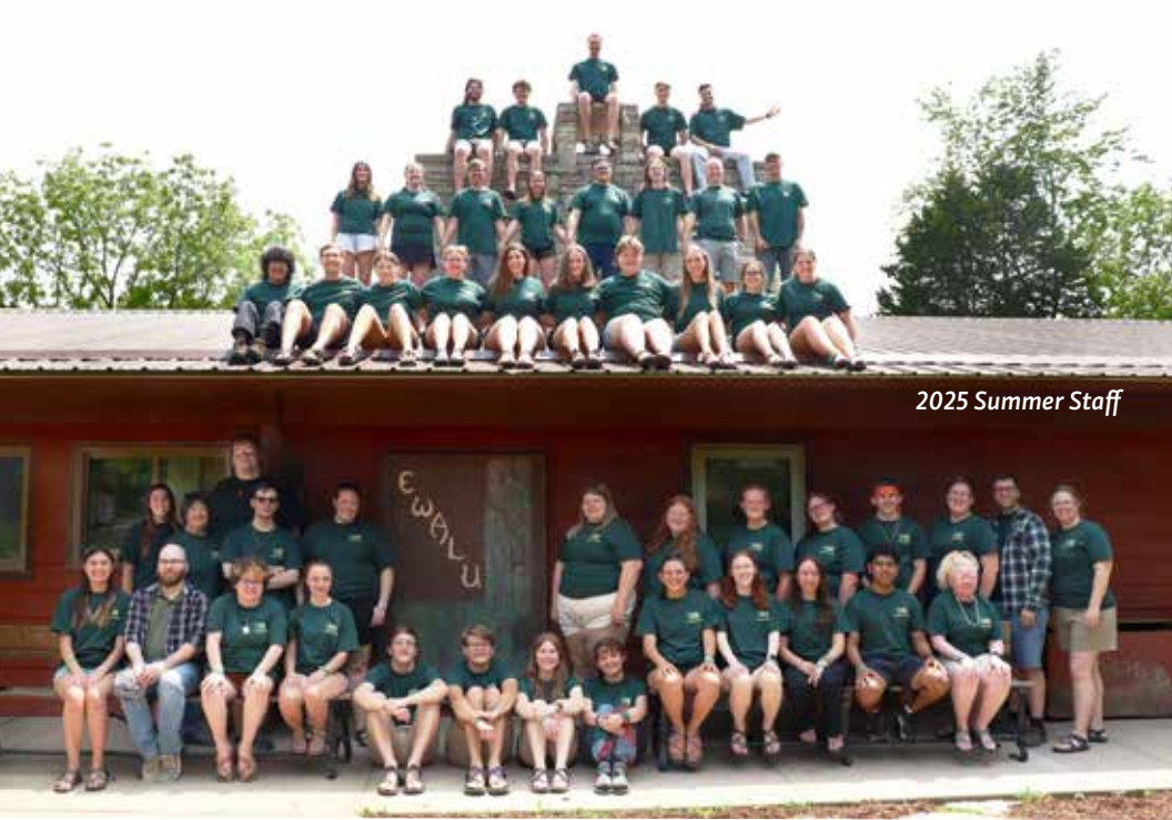
2025 Summer Staff